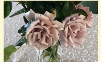
Koko Loco (FL)