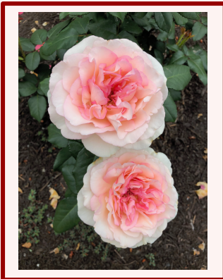
Souvenir de Baden-Baden (HT)