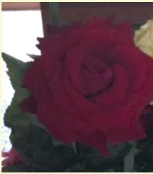
Ingrid Bergman (HT)

Below are pictures of from the Rose Show and the Rose of the Day that held up in the sweltering heat at the KCRS Picnic. Roses were there all day and throughout the heat of the night.