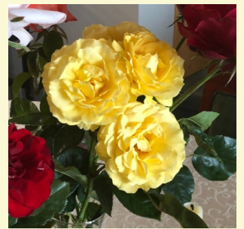
Doris Day Spray (FL)