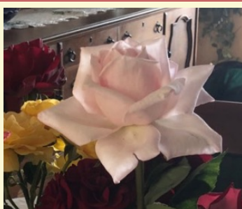
Royal Highness (HT)