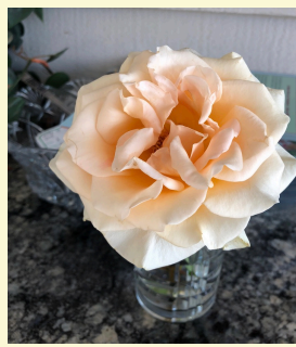
St Tropez (FL)