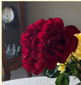
Dublin Bay Spray (CL)